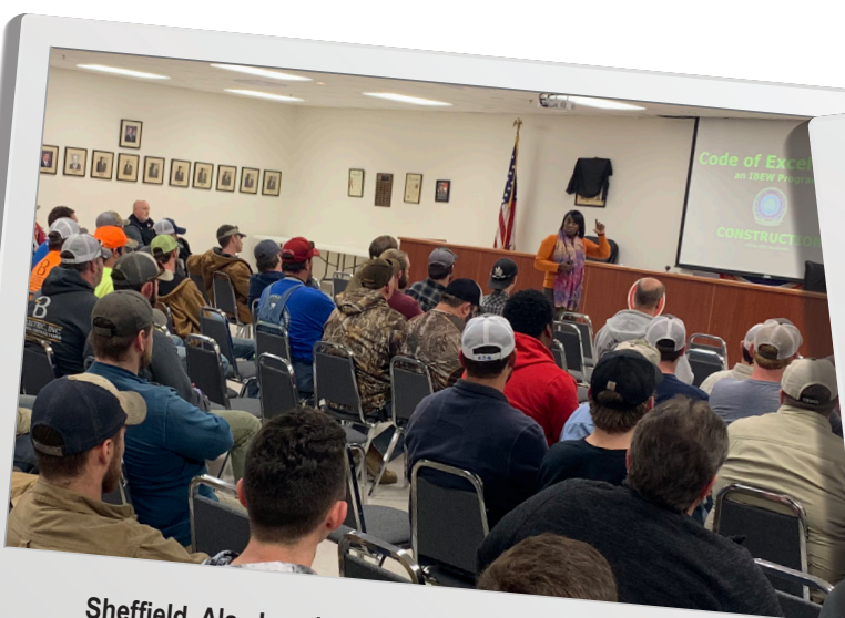
Sheffield, Ala., Local 558 demonstrated its commitment to the IBEW's core principles with Code of Excellence training in February.